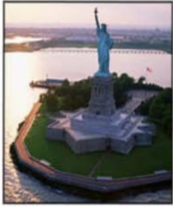
breathtaking skyline views