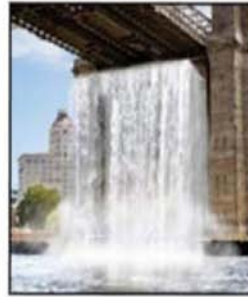
a showcase of science & society