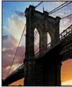
food & dance